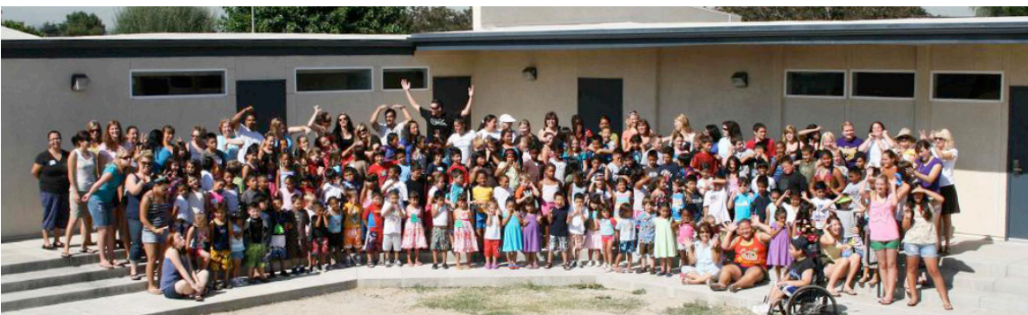
The students and adults in our VBS last week celebrating in anticipation of the completion of our new buildings!

P.S. Please join us in praying in the final $19,466 to Complete the Vision...and give if you are able!